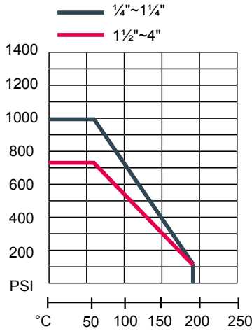
Pressure Temperature Compare